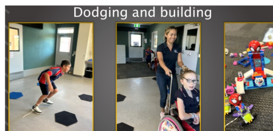
Dodging and building